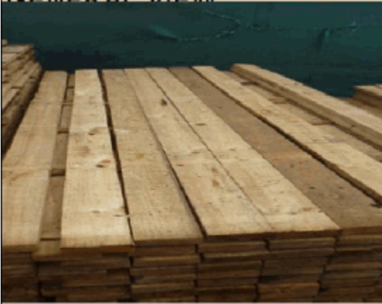
Vista general (Overview)