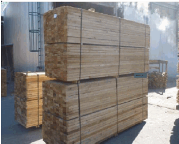
Vista general del producto (Product Overview)